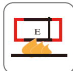
Circuit Integrity IEC 60331-23/BS 6387(Optional)